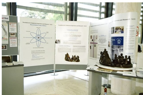
S.E.R. booth at the Innovation Fair