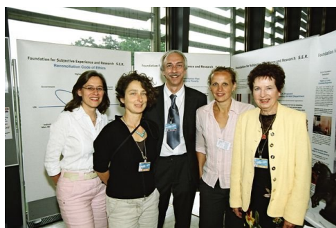
S.E.R. Members and Representatives